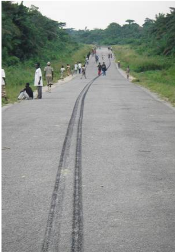
Photograph 1: Section of the road used as an airstrip in Mobi, Walikale

111. The Goma airport, with an average of nearly 40 movements per day, has become the leading airport in the eastern part of the Democratic Republic of the Congo from the standpoint of air traffic. Registered traffic at Goma includes nearly 40 aircraft of all types (Twin Otter DHC-6, Cessna Caravan, AN-12, LET410, AN-24, AN-32, DHC-8, CASA 212, Partenavia 68 CTC).