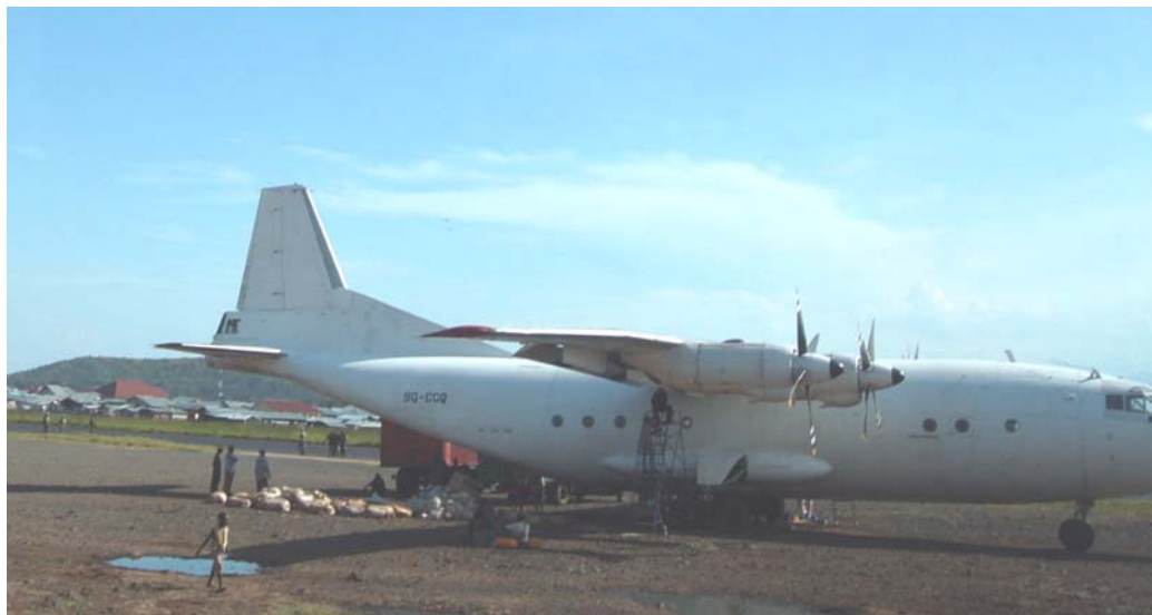
Photograph 3: Presence of Antonov 12, owned by GLBC, in Goma during the week of 20 to 26 May 2007